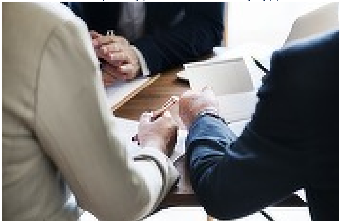
The number of newly established foreign capital firms has decreased