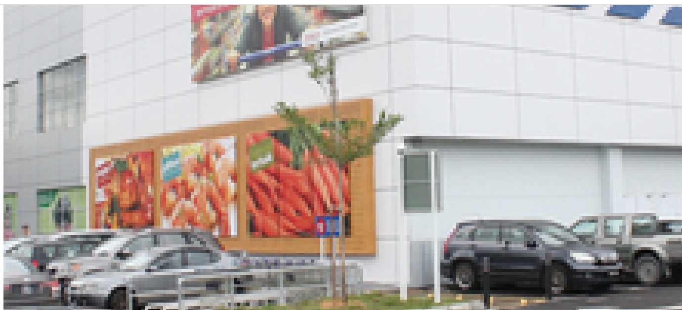
ECJ Decision: Tesco and Vodafone lose dispute with Hungary over certain taxes criticized for undermining foreign players

THB 0.1371 -0.0008 ▼ TRY 0.6968 0.0010 ▲ UAH 0.1735 -0.0010 ▼ XE