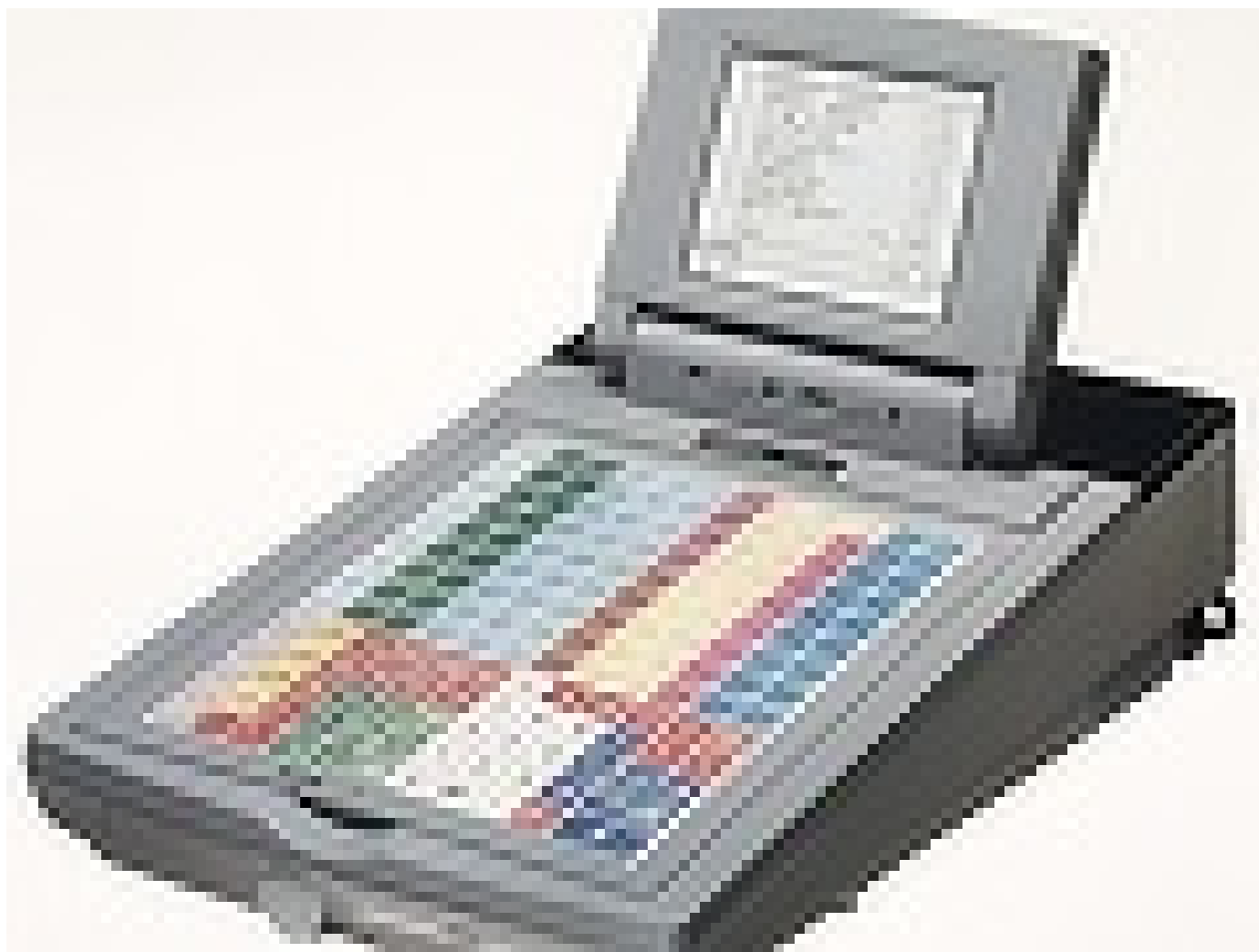
The fines for the lack of cash register houses, up to 10,000 lei, can come from April. The Government does not rush to remove from the Law of prevention the failure to equip companies with electronic fiscal fiscal