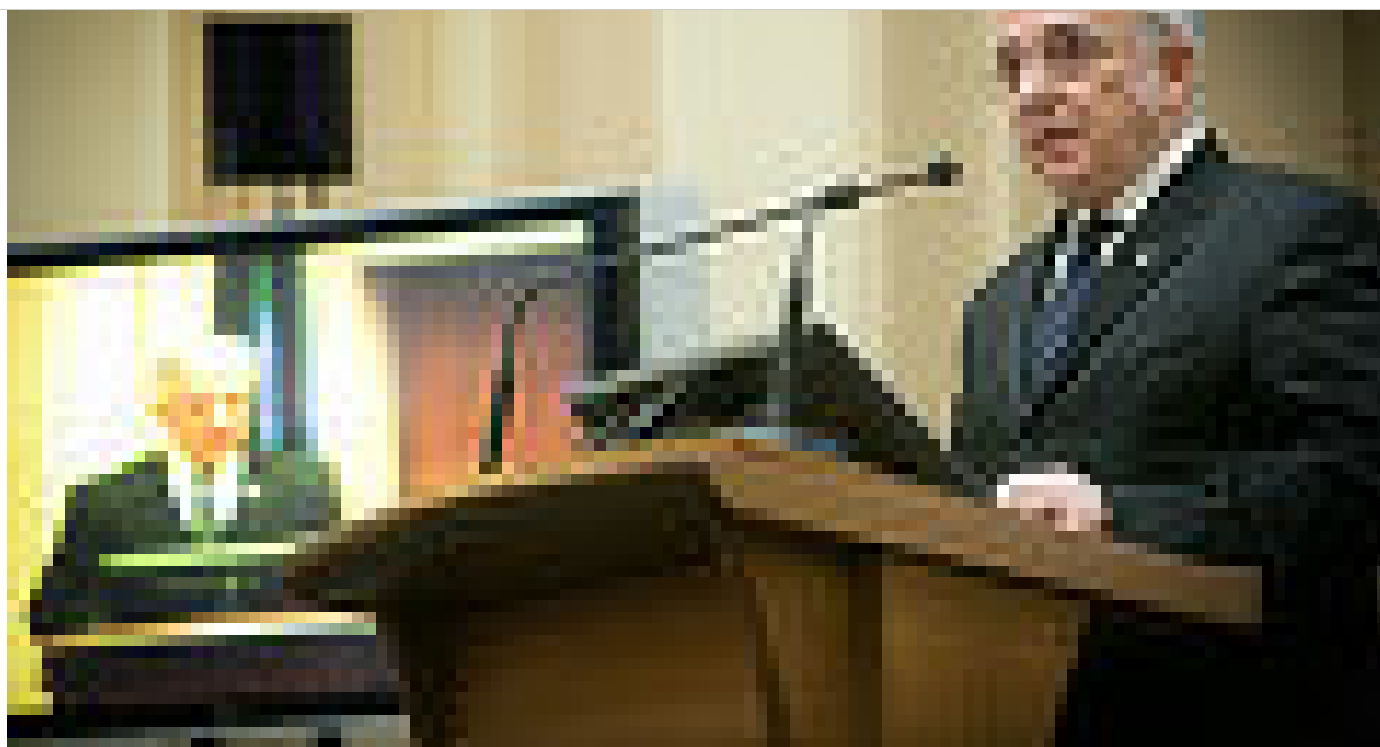
GRAFIC Isărescu warns again that deficits must be reduced: If your mind does not come to you in time, others will correct you

THB 0.1371 -0.0008 ▼ TRY 0.6968 0.0010 ▲ UAH 0.1735 -0.0010 ▼ XE